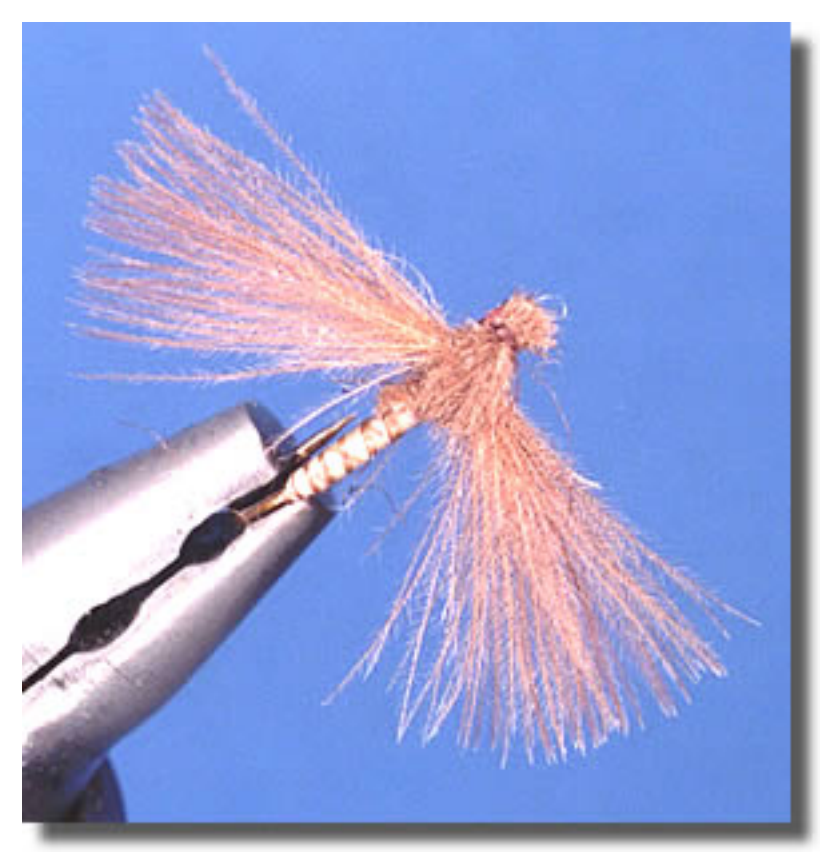
By Bob Bates

Oh No not another caddis pattern!!!! Yes, and there are good reasons for it. Caddisflies are among the most abundant of insects with about 7,000 species worldwide (1,200 species in North America). They can tolerate water that is not pristine, and fish like to eat them. Sizes range from micro-caddis 1/8th-inch long to monsters 1-1/2 inches long. Fortunately the angler doesn't have to imitate all of them. There are a lot of browns, tans and olives among them, with a few other colors. They all have about the same shape.