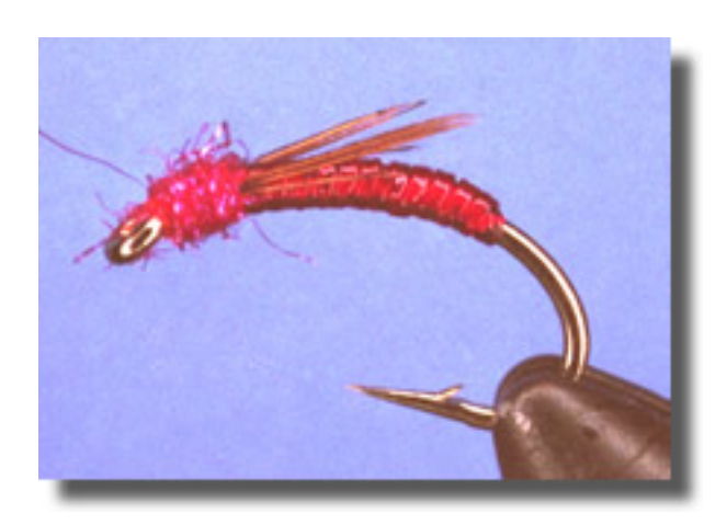
By Bob Bates

Our lakes and many streams are filled with chironomids (midges). They are in the water all year and hatch anytime there is open water. They belong to the order Diptera meaning two winged. Other members of this true flies order include craneflies and mosquitoes. Adult chironomids are sometimes confused with mosquitoes because of their size and shape. However, they have one important difference: Without a sharp proboscis they can't bite.