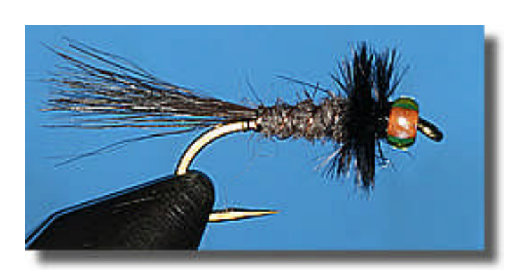
Published by Bob Bates International Federation of Fly Fishers - Washington Council