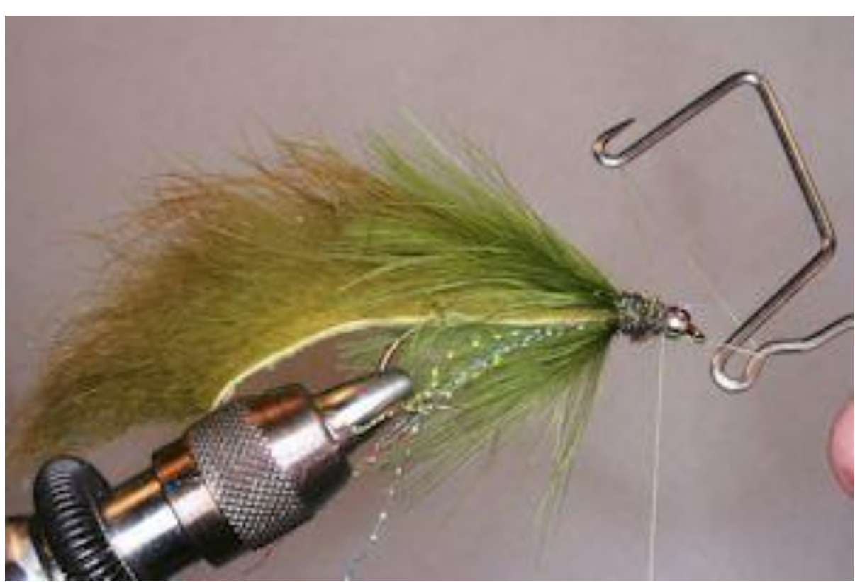
Step 13 Whip finish behind the bead.