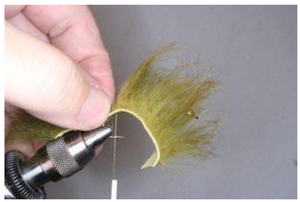
Step 4 Cut a strip of rabbit strip to tie onto the hook at the bend of the hook. Tail should be as long as the shank