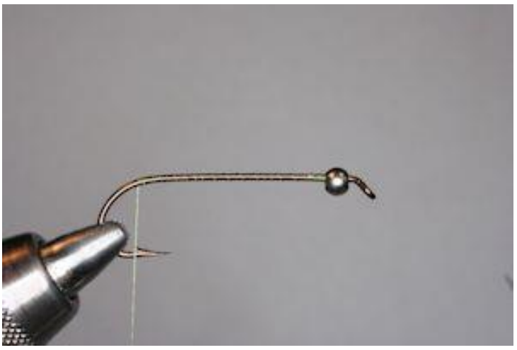
Step 3 Bring your thread to the bend of the hook