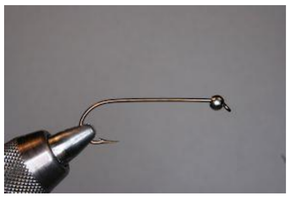
Step 1 Start your tying thread at the eye