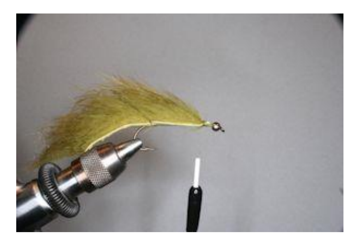
{\bf Step~6} \\ {\bf Tie~down~the~rabbit~strip~leaving~a~space~between~the~strip~and~the~bead~for~the~Marabou~color.}