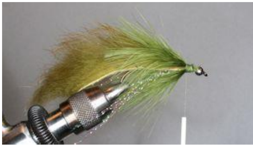
Step 10 Tie in the marabou fibers on top.