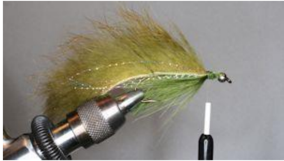
Turn the fly right side up. Get ready to tie some marabou .fibers on top of the fly