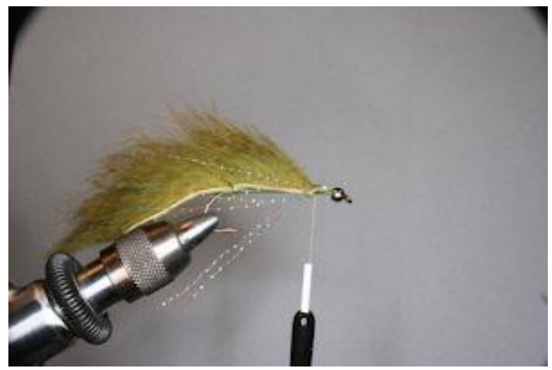
Step 7 Tie in some flash, I am using Krystal Flash. Tie a few strands on both sides of the fly.