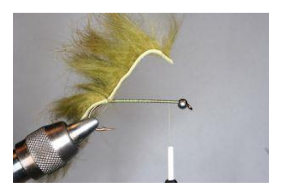
Step 5 Lift up the rabbit strip and bring your thread toward the eye behind the bead.