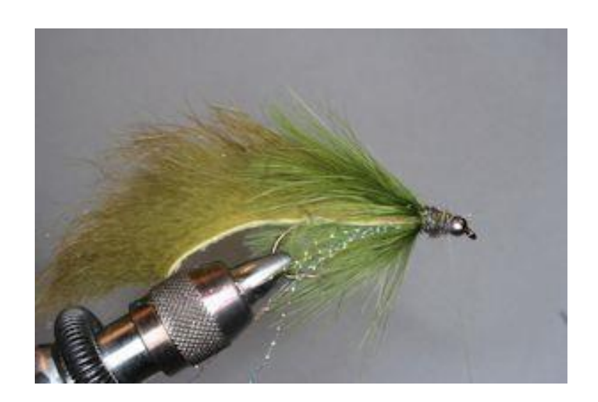
Step 12 Dub the head right behind the bead.