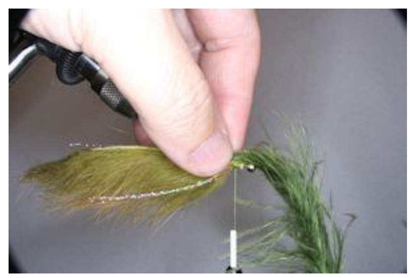
Step 8 Turn the fly upside down and tie in some marabou fibers for the collar.