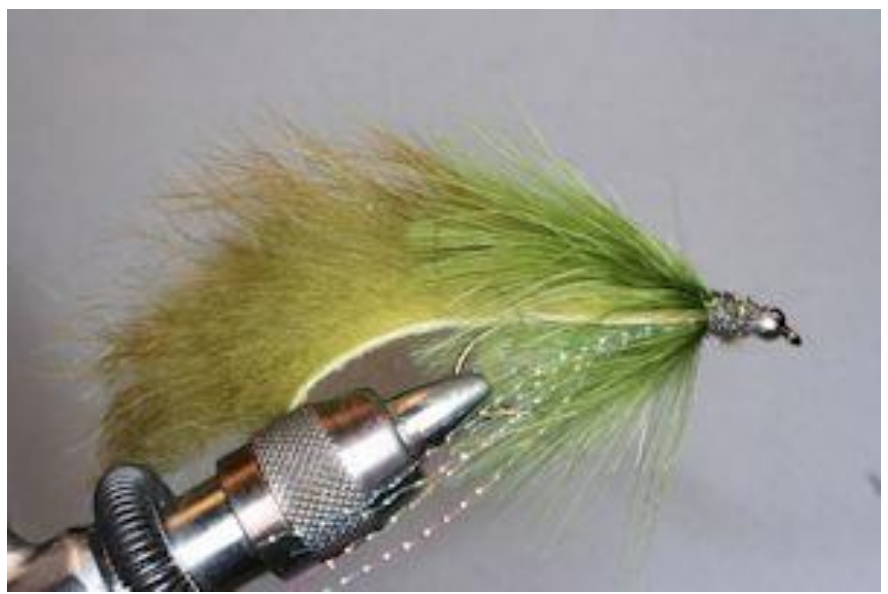
Step 14 Completed Bouface Streamer