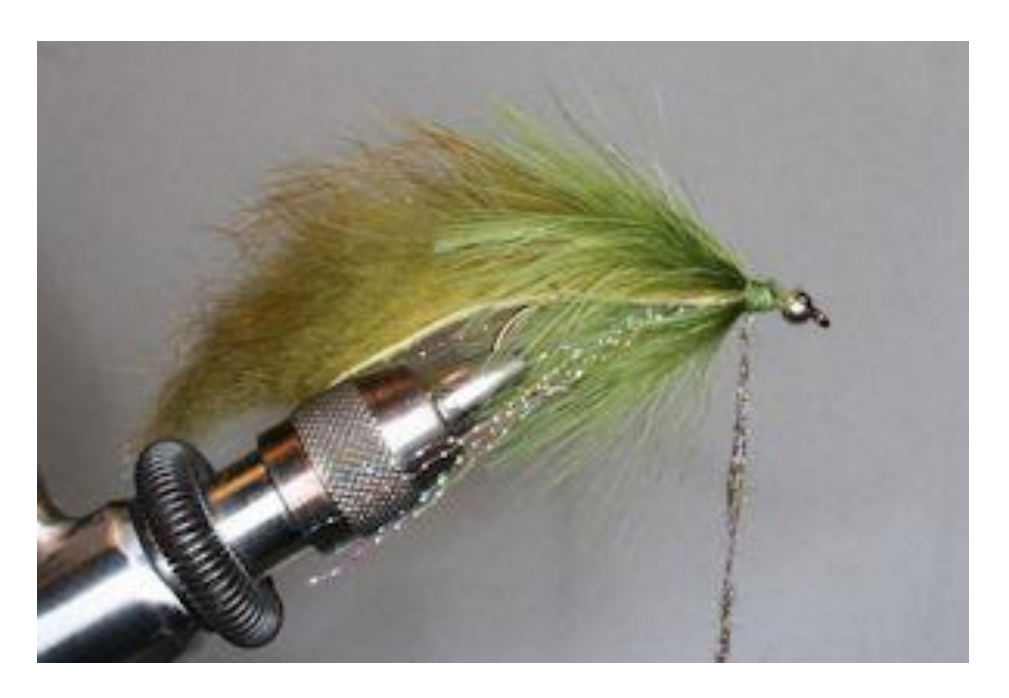
Step 11 Dub the head, use any color you like, I am using peacock herl for the head