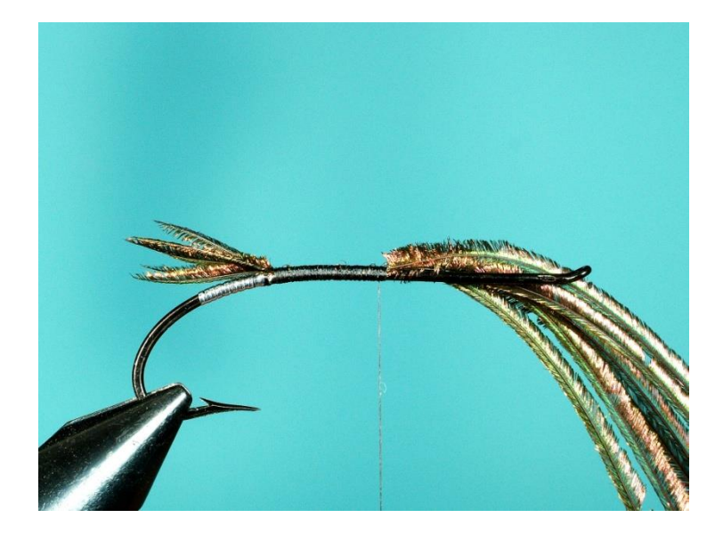
2. Select several peacock herls, even their tips, and tie them to the hook to form a tail as about long as the distance of the gape.