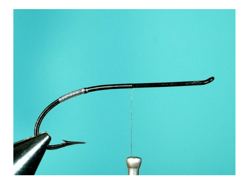
1. Mount the hook in the vise and attach the thread above the point. Tie on a section of flat silver tinsel and construct a tag as illustrated. Wrap the thread to the center of the hook.