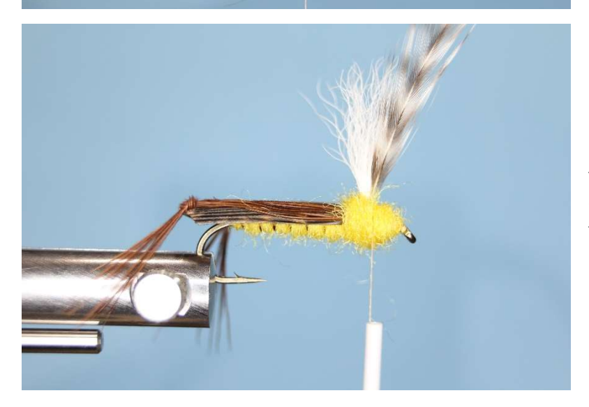
14. Tie on each side knotted pheasant tail fiber legs and dub the head to the eye and back to the wing post. Hang the thread around the wing post.