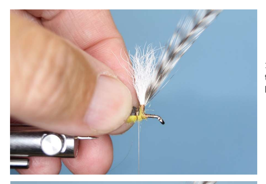
12. Cup the turkey strip over the body, this is the over wing. Secure to the body behind the wing.