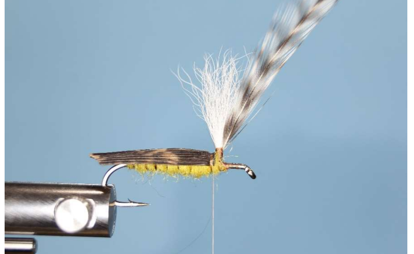
13. By tying the turkey tail on top of the body, this will ensure the wing lays flat on top of the body.